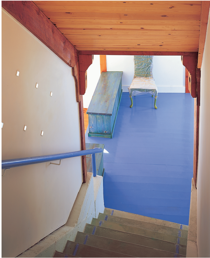
The main staircase at the Berryessa house, looking down toward the kitchen, 1986