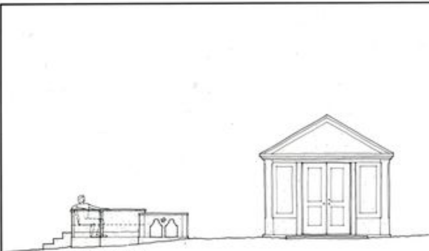
SIDE ELEVATION (continued) 1/8" = 1'-0"