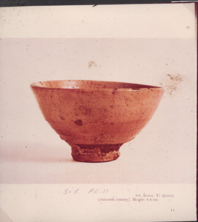
S-6 Pg. 11 owl Korea, Yi dynasty (sixteenth century). Height: 8.8 cm. 11

positive-negative Both the thing itself and the space next to it are clear entities, which have good shape.