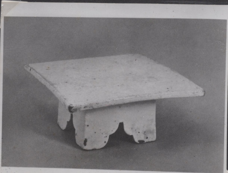
64. Ceremonial stand, porcelain. Korea. Yi dynasty (eighteenth century). Height: 8 cm.