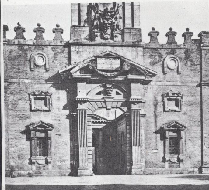
Michelangelo: Porta Pia, Rome

Each one of these objects is highly articulated. But in which one of them you can feel that you can hear the same voice coming from its differentiated forms?